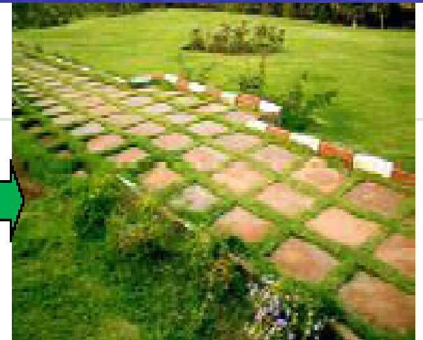
After landfill closure