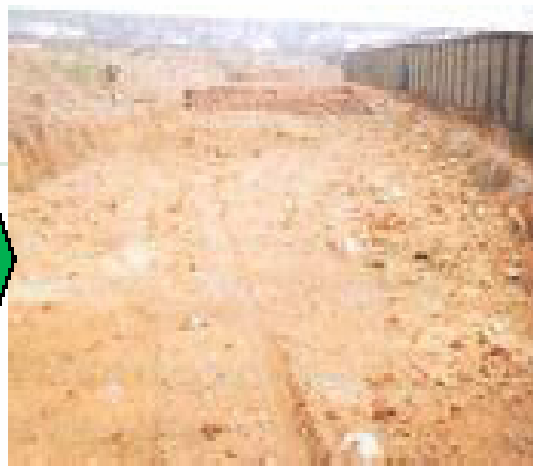
After Shifting and Capping