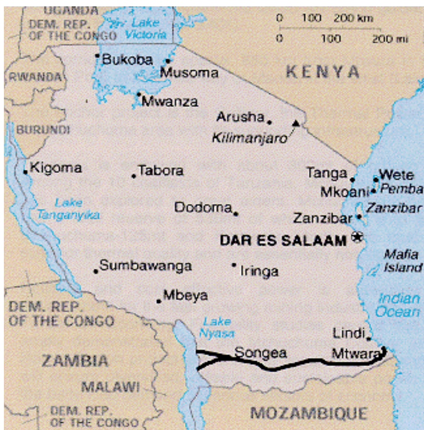
Map of Tanzania showing the Mtwara region in the South

[both two pieces of text should stress more the expanding economic activities due to the “new” grid. It is now somewhere mentioned in the text but is not really stressed]